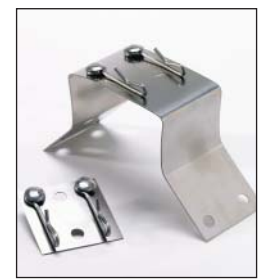
Nixalite's fabrication facility produces all types of custom forms including the I-Beam Clamps, Glue Clip and Ridge Cap.

Nixalite customers receive honest and direct answers. Honesty still is the best policy and Nixalite knows that satisfied customers become loyal customers. When you call Nixalite, you are talking with a real person that