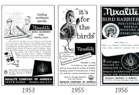
Examples of early Nixalite advertising campaigns

In the 50's and 60's bird control was a new idea and people had a difficult time understanding that those "little birds" were causing structural damage, additional building maintenance, bringing parasites and bird-borne diseases with them. Nixalite had to first educate the public about the hazards of pest birds and their droppings before selling them on the need for bird control. Nixalite made people aware of the benefits of bird control through well targeted and informative advertising campaigns. While it took years to accomplish, Nixalite had pioneered the path for a new industry.