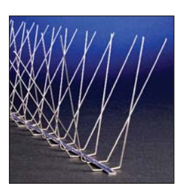
Pigeon Spike Stainless Economy Bird Spikes

Several different types of bird netting and netting accessories are available as well as tensioned perimeter and support cable hardware.